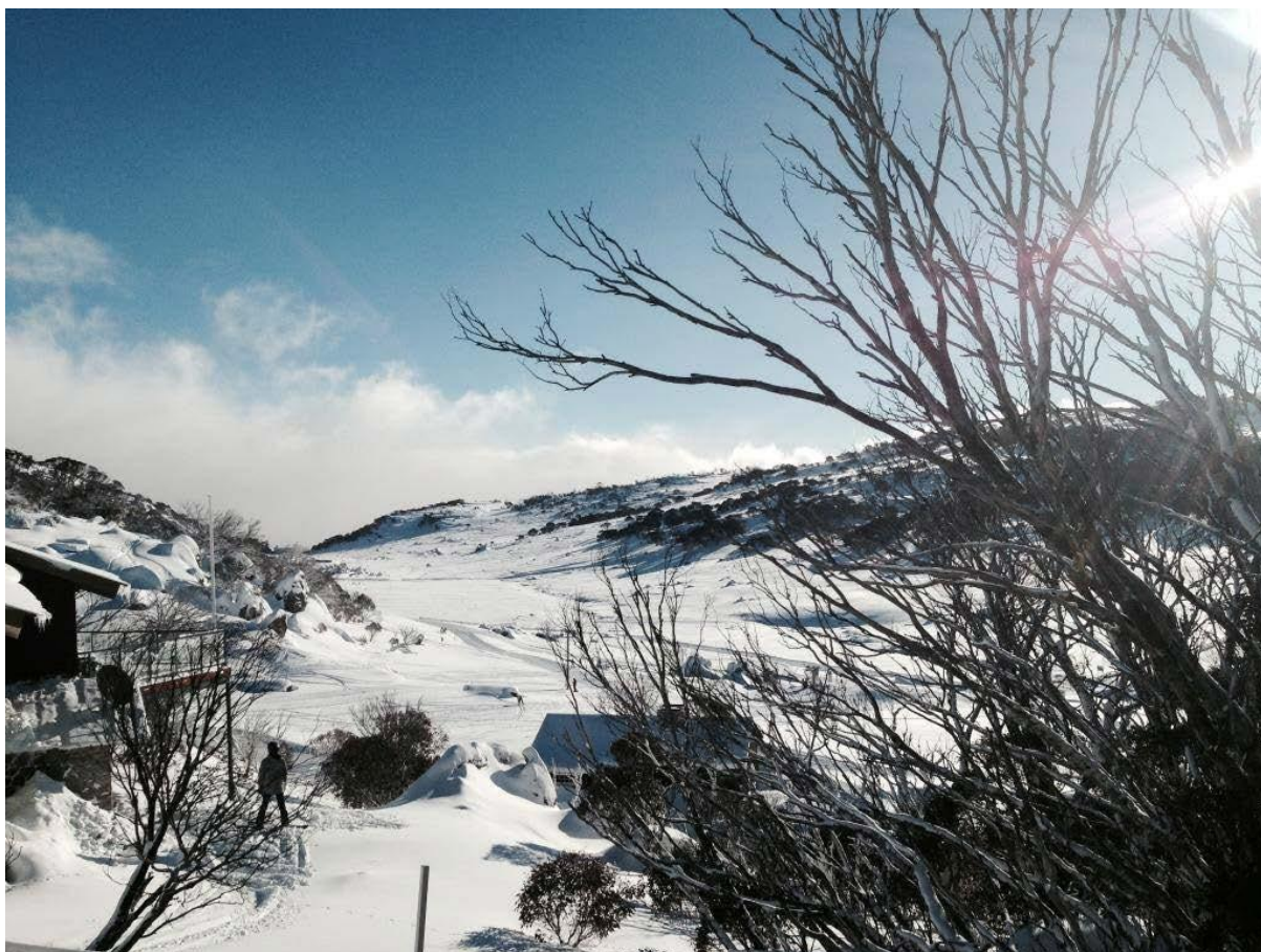
View from the Lodge from the Living Room, overlooking the large deck which includes outdoor seating and BBQ.